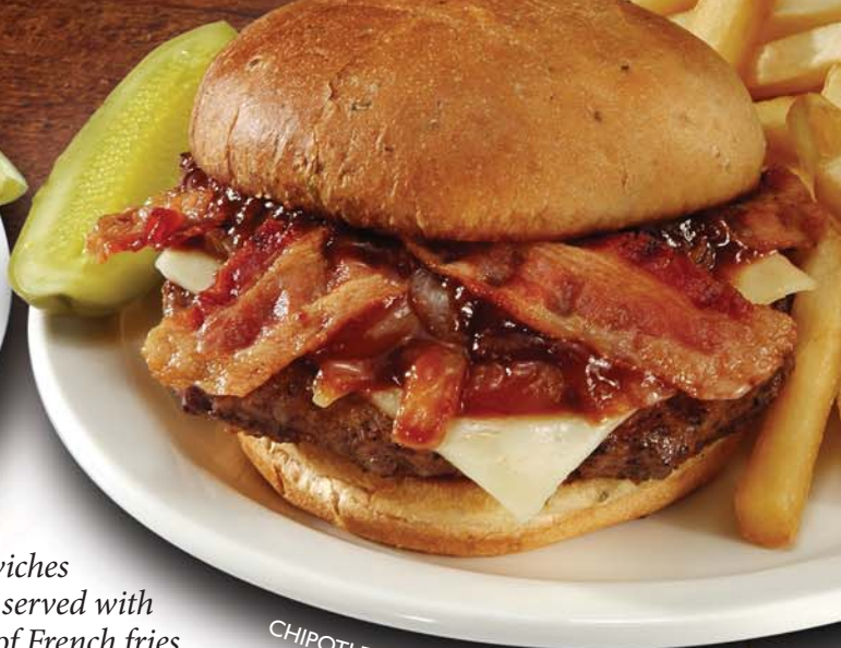
CHIPOTLE BACON STEAK BURGER

All sandwiches and burgers are served with a heaping helping of French fries.