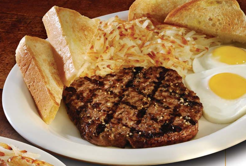
CHOPPED STEAK AND EGGS