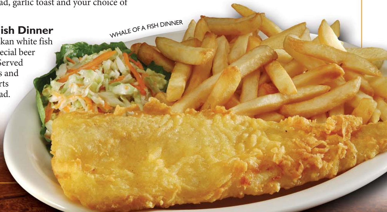
WHALE OF A FISH DINNER

Load 'er up with shredded cheddar cheese, bacon bits and diced red onions for only $1.99 with any entree.