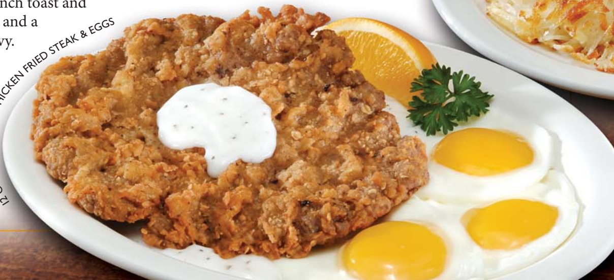
12 OZ. HOMESTYLE CHICKEN FRIED STEAK & EGGS

Two eggs any style, served with sausage gravy and biscuits $5.99