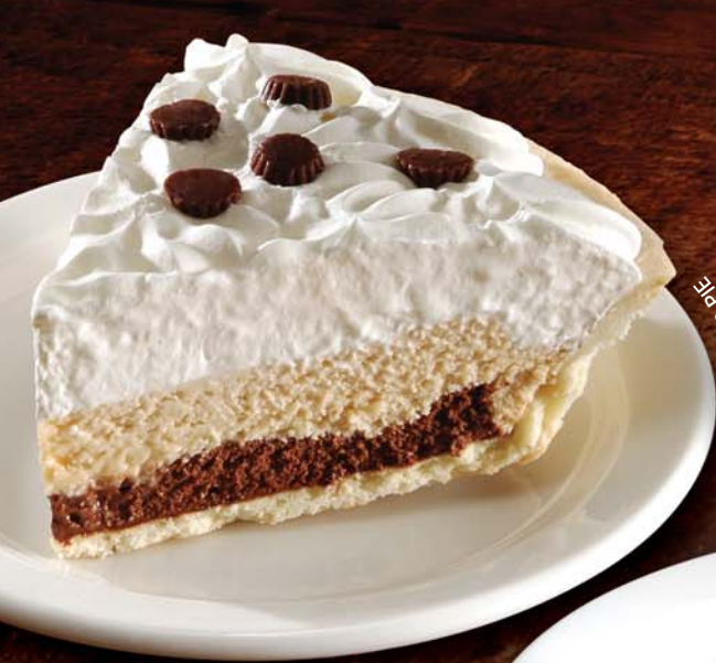
PEANUT BUTTER PIE