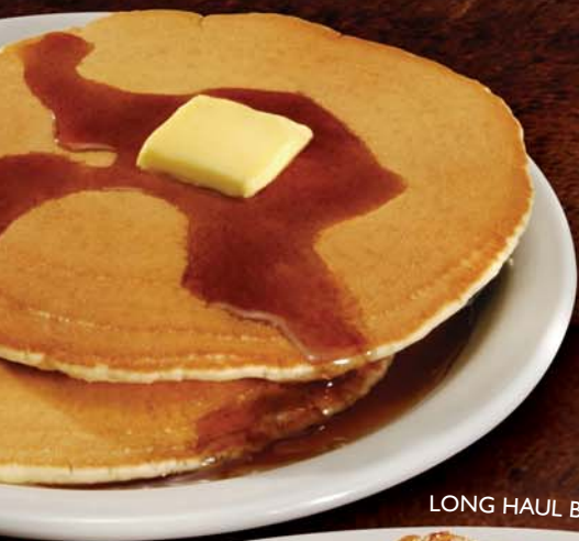
LONG HAUL BREAKFAST