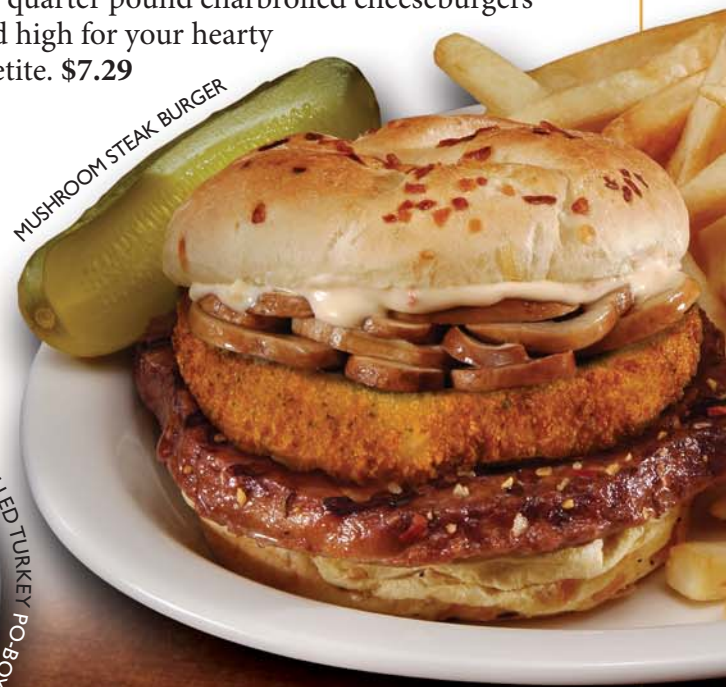
MUSHROOM STEAK BURGER

Two quarter pound charbroiled cheeseburgers piled high for your hearty appetite. $7.29