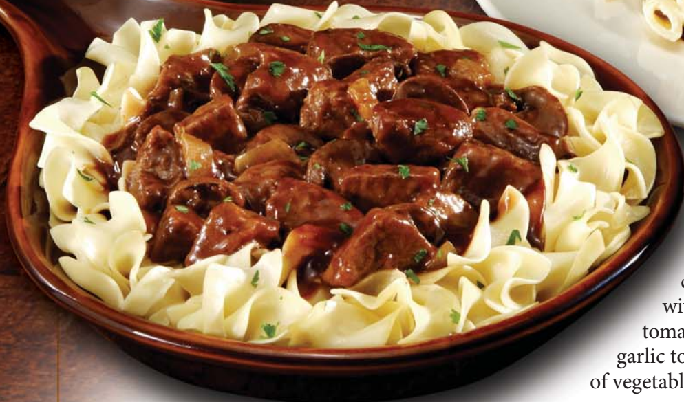
SIRLOIN STEAK TIPS