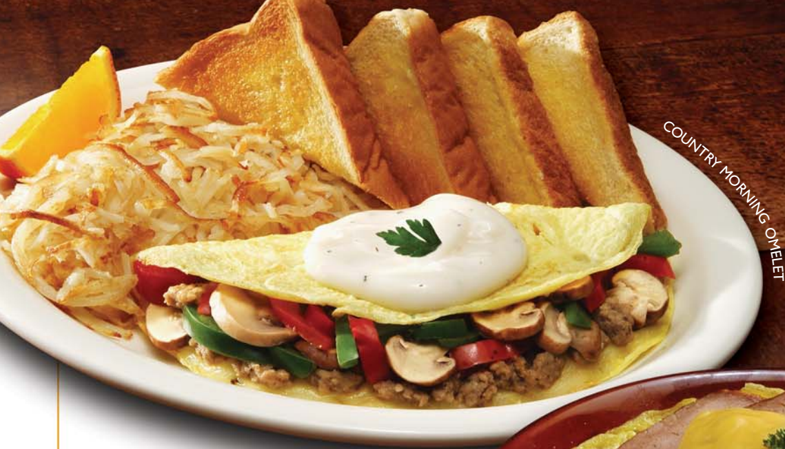
COUNTRY MORNING OMELET

* NOTICE: Consuming undercooked meats or eggs may increase your risk of food borne illness.