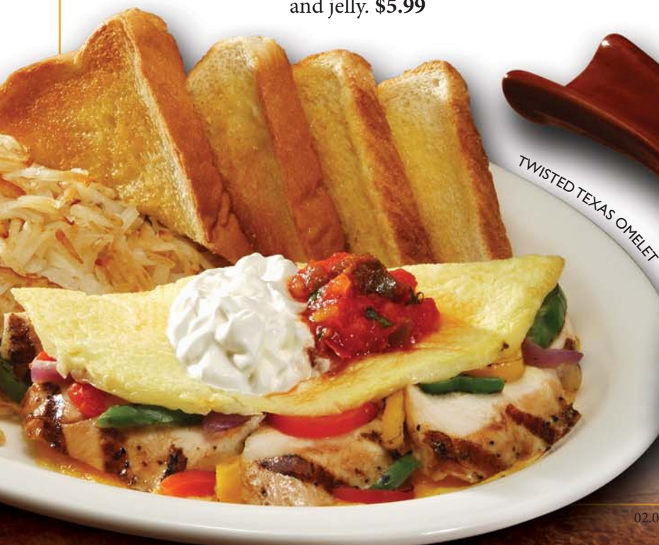
TWISTED TEXAS OMELET

Open-faced omelet layered with hash browns and country sausage, then topped with country gravy and shredded cheddar cheese. Served with Texas Toast and Jelly. $6.79