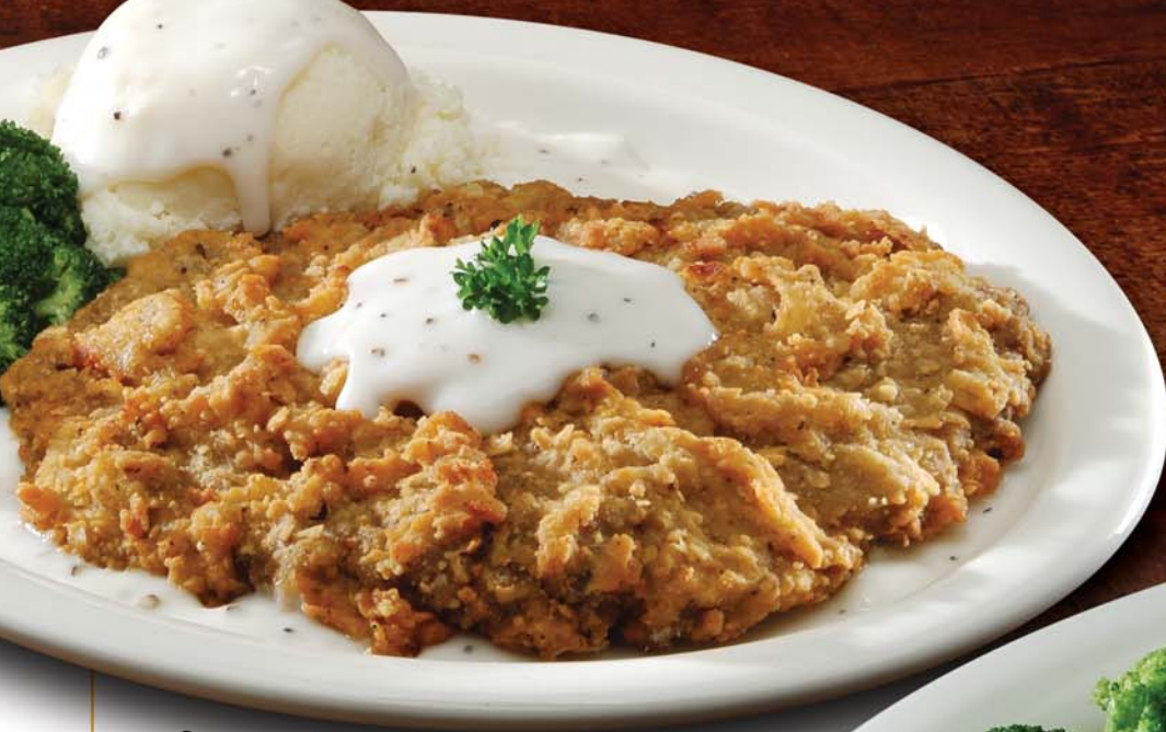
CHICKEN FRIED STEAK PROFESSIONAL PLATTER