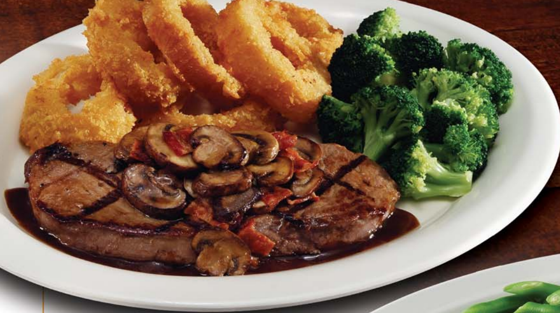
SIRLOIN STEAK WITH MUSHROOM TOPPER

All entrees include a garden fresh dinner salad. Or for a heartier appetite enjoy our never ending Soup & Salad Bar for only $1.99 with your dinner entree.