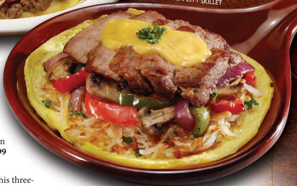
MOUNTAIN CITY SKILLET

A delicious three egg omelet stuffed with your choice of American, Swiss or cheddar cheese. Served with golden hash browns, Texas Toast and jelly. $5.99