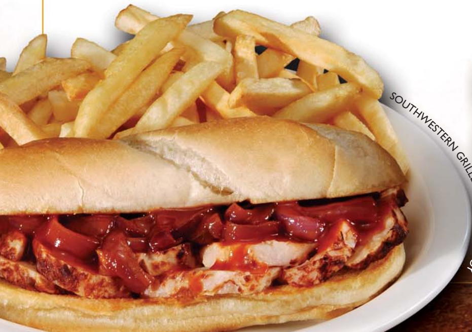
SOUTHWESTERN GRILLED TURKEY PO-BOY

A traditional and tasty lunchtime favorite! $5.99