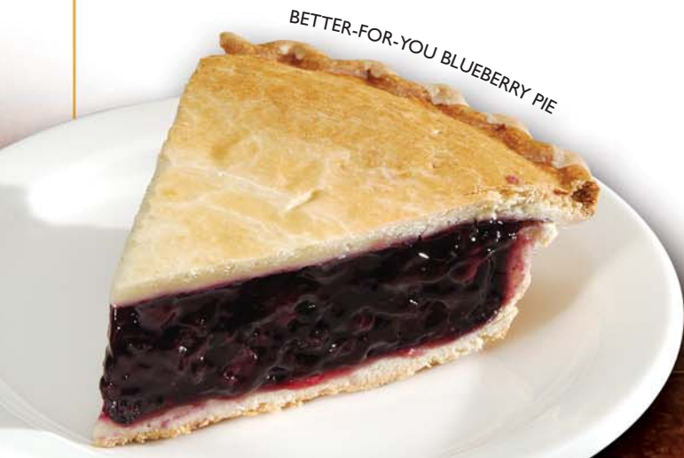
BETTER-FOR-YOU BLUEBERRY PIE

Traditional-style blueberry pie with no sugar added and a reduced-fat crust. $3.29