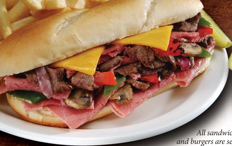
HIGHWAY TANDEM HOAGIE